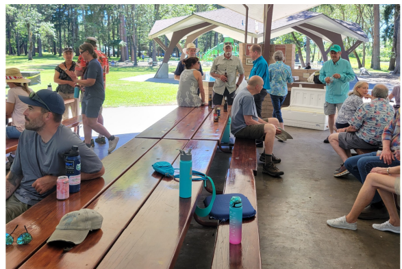
Club Picnic: (submitted by Robbi Dubois)