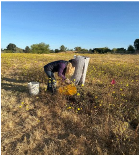
Figure 2. Volunteer water plants.

ODFW is asking for volunteers to help water the plants at both sites during the hot summer days. Volunteers help fill 5-gallon water buckets and carry them to the plants. The work is rewarding and does not take long. If five volunteers show up, it only takes an hour to water all the plants.