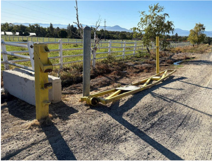
Figure . Photo of entrance gate at Denman Wildlife Refuge

Vandals have removed the entrance gate to the north side of Denman Wildlife Area (as shown below), allowing anyone access without a key.