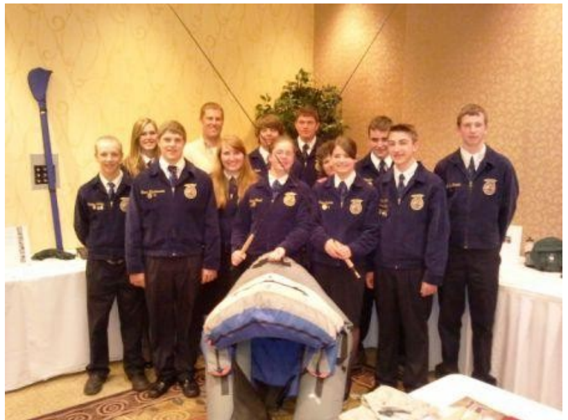
Our FFA Members from Crater High School—Student Auction Volunteers