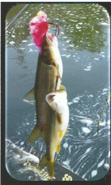
Umpqua Pikeminnow were illegally introduced to the Rogue River around 1978 near Wolf Creek in a farm pond.