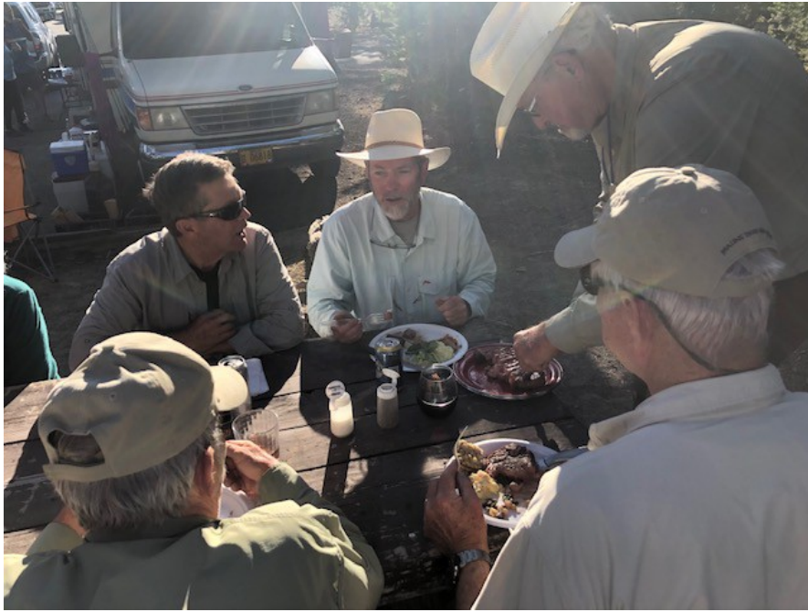
This looks serious!

It was great to see many of the attendees that brought boats, offered available seats to other members for some time on the Lake. A couple of Hosted Trips took place during the week as well. These were Club Auction Trips that had been won previously and fulfilled during the week. They went well, folks had fun, learned a lot and benefitted from the knowledge, skills and experiences of some really accomplished fishermen.