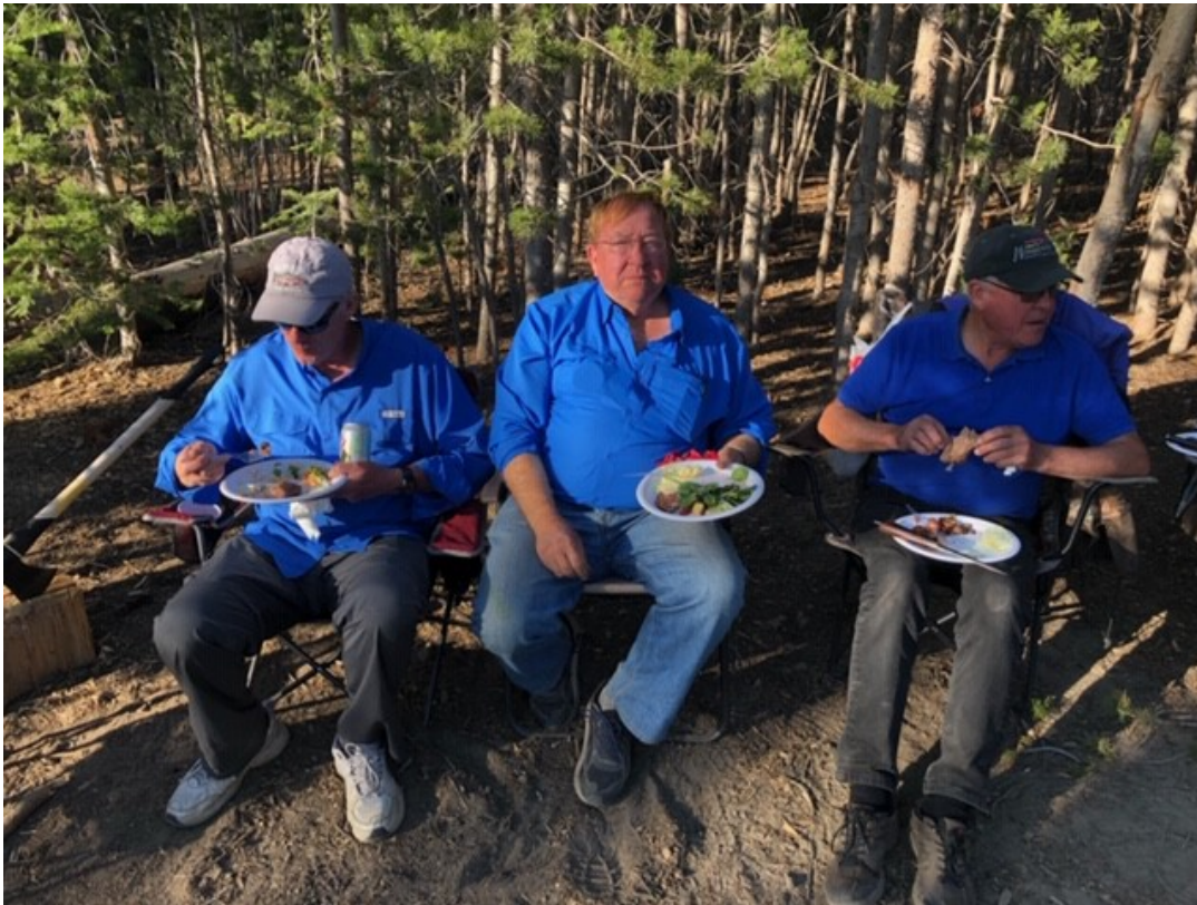
And I'm pretty sure these guys talked about what to wear that day!

Your Hosts would like to thank everyone that attended and reiterate it is our pleasure to be able to host these events. We had a great time, had a lot of fun and are looking forward to more!