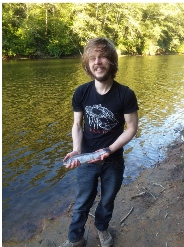
Rainbow Trout caught at a local reservoir this summer.