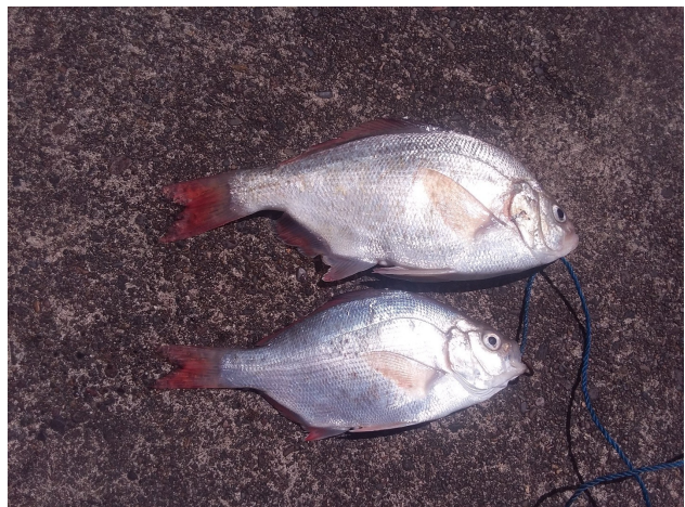
A couple Red Tailed Surperch I caught this summer.