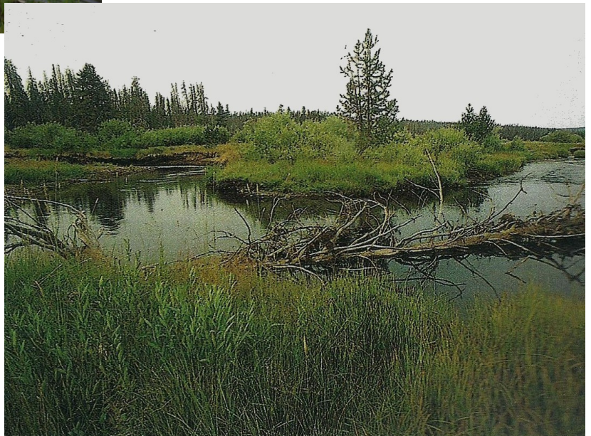
North Fork of the Sprague River at Lee Thomas Meadow